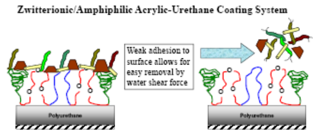
Fig. Depicting the Coating System

Since the amphiphilic substance has both hydrophobic and hydrophilic moieties on one compound, the polymer forms nanoscale heterogeneities, creating a surface topography that is unsuitable for the proliferation and adsorption of proteins and marine micro-foulers.