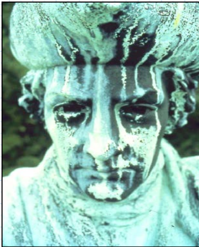
Washington Monument, Thomas Crawford and Randolph Rogers 1858, Richmond, VA

Scientists at NDSU have recently invented a novel protective coating for outdoor bronzes that affords both superior protection and easy removal.